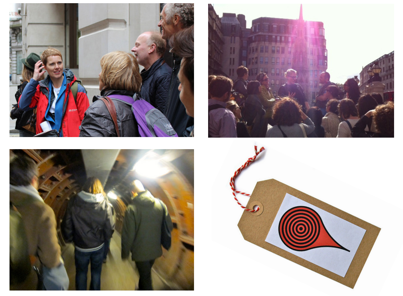
Clockwise from top left: The London Ear, A Genius Tour, Dotmaker Tours Gift Voucher. A Rubbish Trip